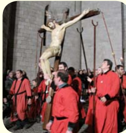
Image of Jesus Crucified

This image of Jesus dead on the cross represents the highest moment of His Passion as a sign for our redemption. It is the core of our procession.